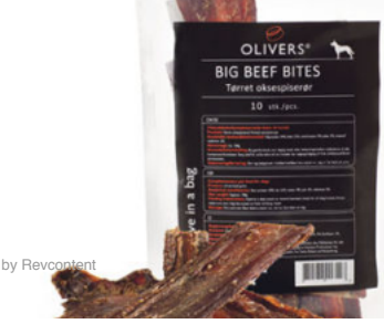
Olivers big beef bites