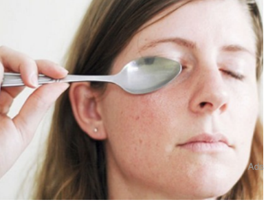
Surprising New Method to Improve Vision Naturally (Try It Tonight)