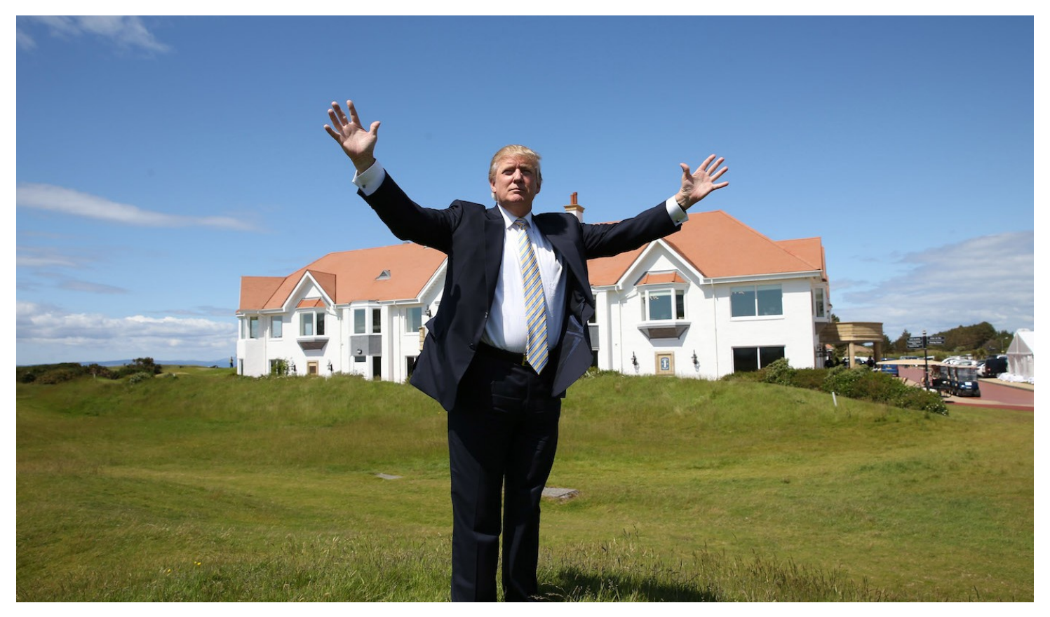
Trump's Economy in a Time of Scandal